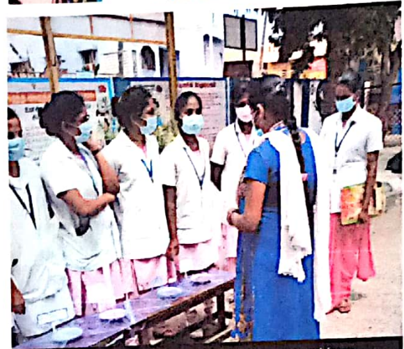
No.87, Pillayarkuppam Road, Kirumampakkam, Puducherry 607403, India Latitude 11.82044337° Longitude 79.78396048° Local 11:29:16 AM Altitude -79.98 meters GMT 05:59:16 AM Wednesday, 04-08-2021 Note : Department of Child Health Nursing Breastfeeding Week Celebration Diet exhibition 04.08.2021